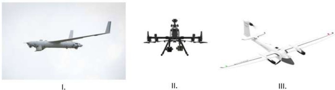
Figure 1. Fixed Wing ScanEagle (I), Rotary-Wing DJI Matrice 300 RTK (II), Hybrid VTOL Trinity F90+ (III)

Regarding drone types, UAVs can be broadly categorized into fixed-wing, rotary-wing, and hybrid VTOL (Vertical Take-Off and Landing). Fixed-wing UAVs like the Boeing ScanEagle are known for their long endurance and range, making them suitable for wide-area patrols. Rotary-wing drones such as the DJI Matrice 300 RTK excel in agility and vertical lift, which is advantageous for confined operations. Hybrid VTOL platforms, including the Trinity F90+, combine the strengths of both fixed and rotary systems, offering flexibility in launch and operational endurance.