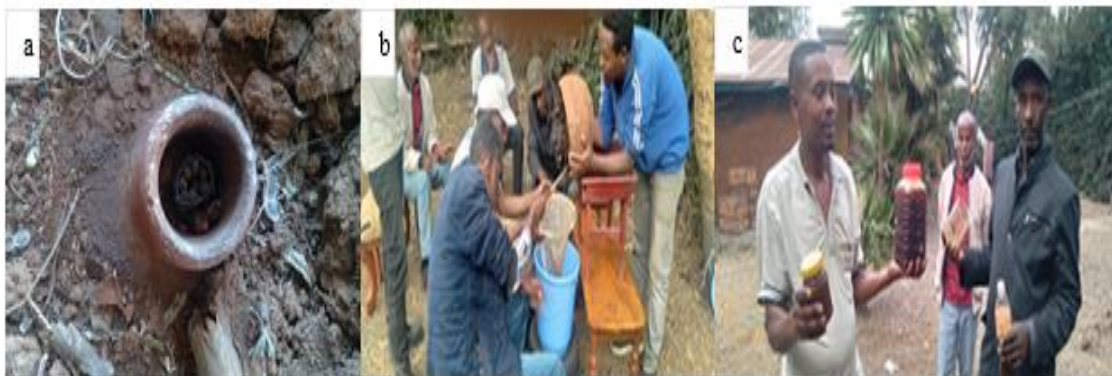
Figure 3. Buried pot hive (a) stingless honey extraction (b), processed honey (c)

Nevertheless, the conventional procedure yielded 0.5-1 liters of stingless bee honey, which is dirty and distracting. The typical amount of honey harvested using conventional stingless methods was 0.6 liters per colony. A sharp stick was used to puncture honey storage chambers during the honey harvest, resulting in the flow of honey (Figure 3b). The flip-over method was used very carefully to filter the ripened honey, keeping debris, fallen branches, and dead bees out of the honey (Figure 3b). The production of stingless honey typically occurs twice a year on average. There have been improvements noted in the quantity and quality of honey produced, as well as in the conservation of species and stingless bee management. Unlike stingless bee's honey hunting, technology adopters (beekeepers) leave some honey for the continuation of the colony. Recipients stated that throughout our time in the area, they had never seen such a large quantity and high-quality honey.