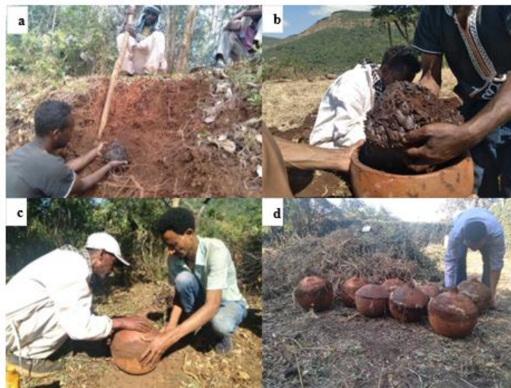
Figure 2. Stingless bees nest excavation (a), transferring into pot hives (b), smear pot with mud (c), and ready for bury (d)

Subsequently, extension agents and beekeepers received theory-cum-practical training as a future resource for people. Training covered hunting, excavating, transferring into pot hives, feeding, and collecting honey for stingless bees ( M. baccarii ). Then, as a learning center (experience sharing) each site per district, apiary sites were developed where stingless nests with pot hives to be set at model beekeepers' backyard. The stingless bee nests were carefully excavated, moved into pot hives, and had their lids sealed with mud (Figure 2a-d). In order to sustain robust colonies, queen right colonies including broods, pollen, and honey were put inside the pot hive. Ultimately, three model beekeepers established 21 stingless bees ( M. baccarii ) and implemented all management procedures, including supplemental feeding and pest control.