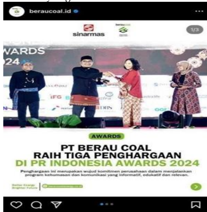
Figure 3. Penghargaan@beraucoal.id

Instagram account @beraucoal.id. In the use of this media, it can make it easier for the people of Berau city to get information about PT. Berau Coal.