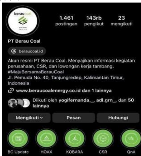
Figure 2. Instagram account @beraucoal.id

PT. Berau Coal is one of the largest coal companies in Indonesia located in Berau Regency, East Kalimantan. 3PT Berau Coal is the fifth largest coal producer in Indonesia which has won various awards in the social and environmental fields from the Government of Indonesia. The use of social media is recognized by the Public Relations of PT. Berau Coal, the management of social media for Public Relations of PT. Berau Coal explained the main public relations tasks to be optimized. Including when there is an information crisis and data confusion, as well as the official account @beraucoal.id and Lembanga Connected that is to be reached for the population. PT. Berau Coal has an Instagram account @beraucoal.id, the Instagram account contains education, publication media and information. The content shared by the Instagram account @beraucoal.id contains ethics in social media such as prevention of hoax news, awareness of social media, information on company activities, CSR, job vacancies and so on. In addition to providing education on ethics in social media, the official Instagram of PT. Berau Coal as a publication media also disseminates information about policies and new information about the Company's activities PT. Berau Coal makes it easier for the public to find information about new policies and information.